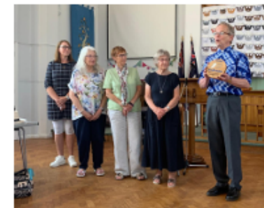
Presentation of the Silver Eco-Award at St Christopher's in Grimsby

Which church will be the next to go for bronze?